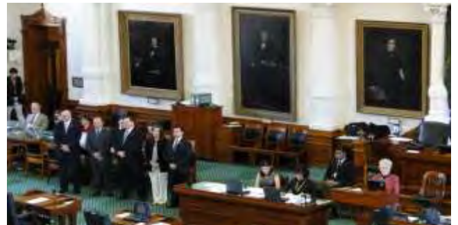
JPCA Representatives on the Senate Floor