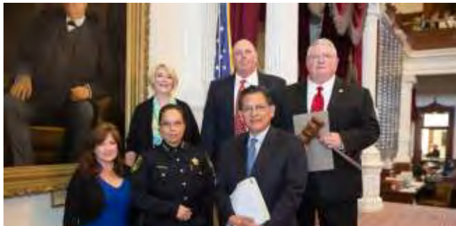
JPCA Representatives on the House Floor